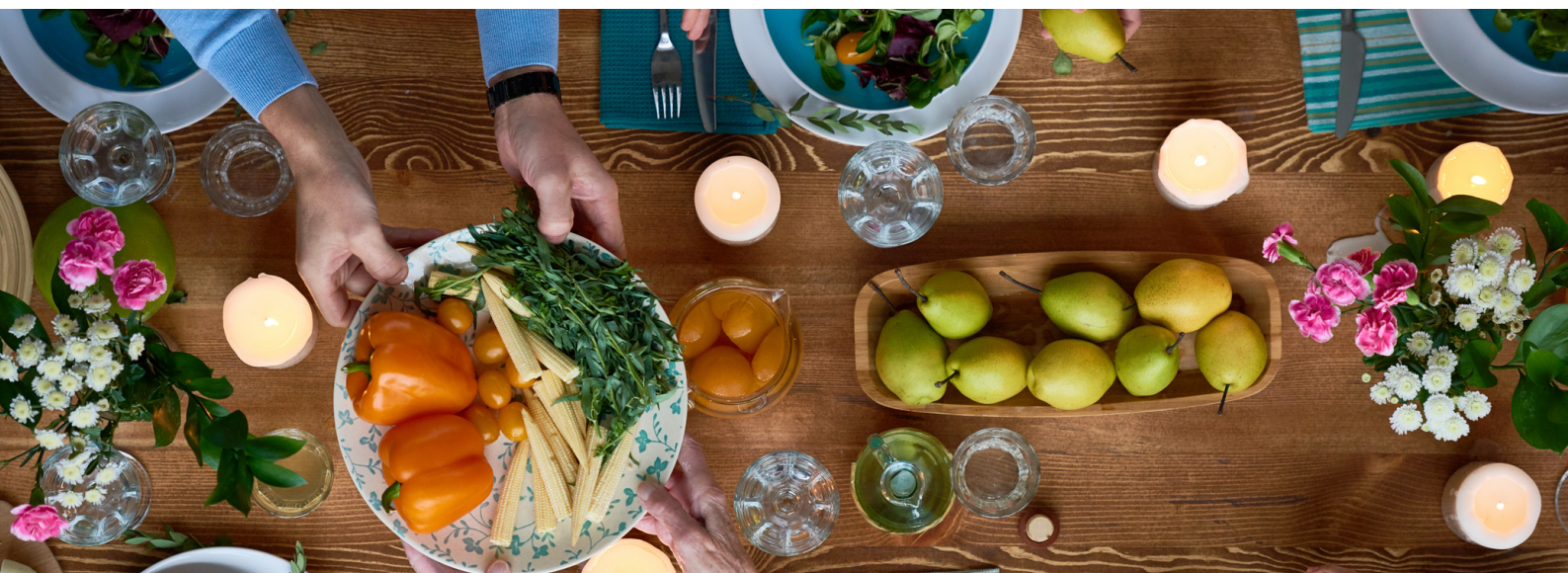
Table manners and dining etiquette including table settings, utensil usage, food handling, and gracious guest guidelines will be covered. At the end of the workshop, students will have the opportunity to “break bread” together and practice their new skills over a delicious 4-course meal.

With less emphasis on outdated rules and more emphasis on mealtimes as a means to build community, Breaking Bread brings friends and families closer together, develops social skills, teaches respect and consideration, boosts confidence and self-esteem, prepares for future success, and promotes health and hygiene.